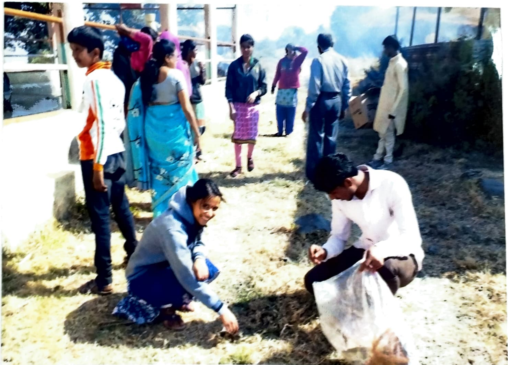
पुढा अंगणवारील मंडिराच्या परिसरालील प्रवास्टिक गेळण करणाऱा स्वयंसेवक