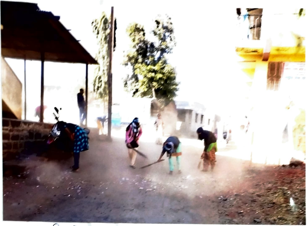
शासक व विद्यार्थी येशील मंडिराच्या परिसर स्वच्छ करणाऱा स्वयंसेविका