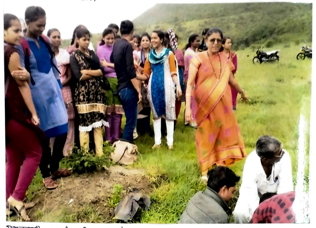
राजनवाडी या विकाली - मुरा डोंगरात्या वायण्याशी ग्रामसेवक वृक्षारोपन करताता