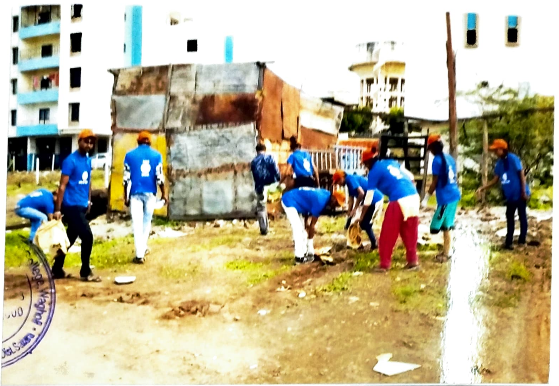
Volunteers are collecting waste material in 'Swacch wari Nirmal wari Harit Wari' Programme 07 03.07.2019