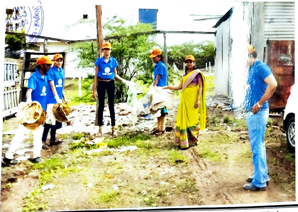
Volunteers are collecting waste material in 'Swacch wari Nirmal wari Harit Wari' Programme 07 03.07.2019