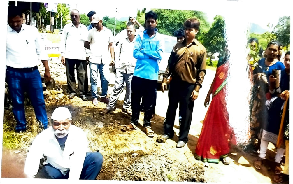
Plantation in Sarkalwadi