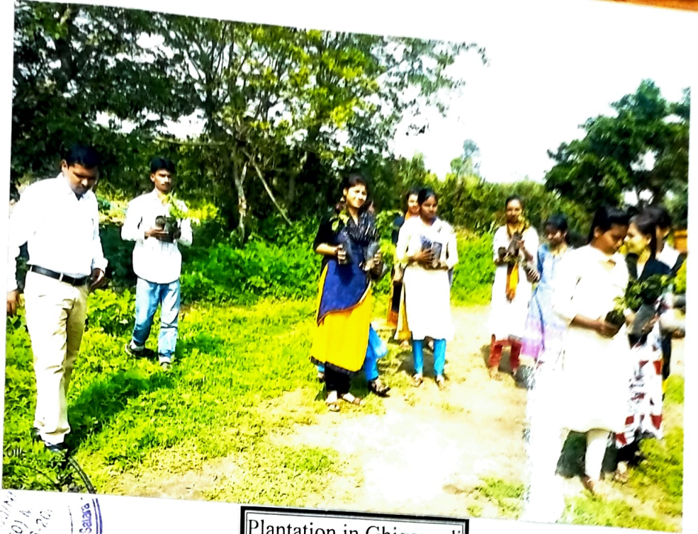
Plantation in Ghigewadi