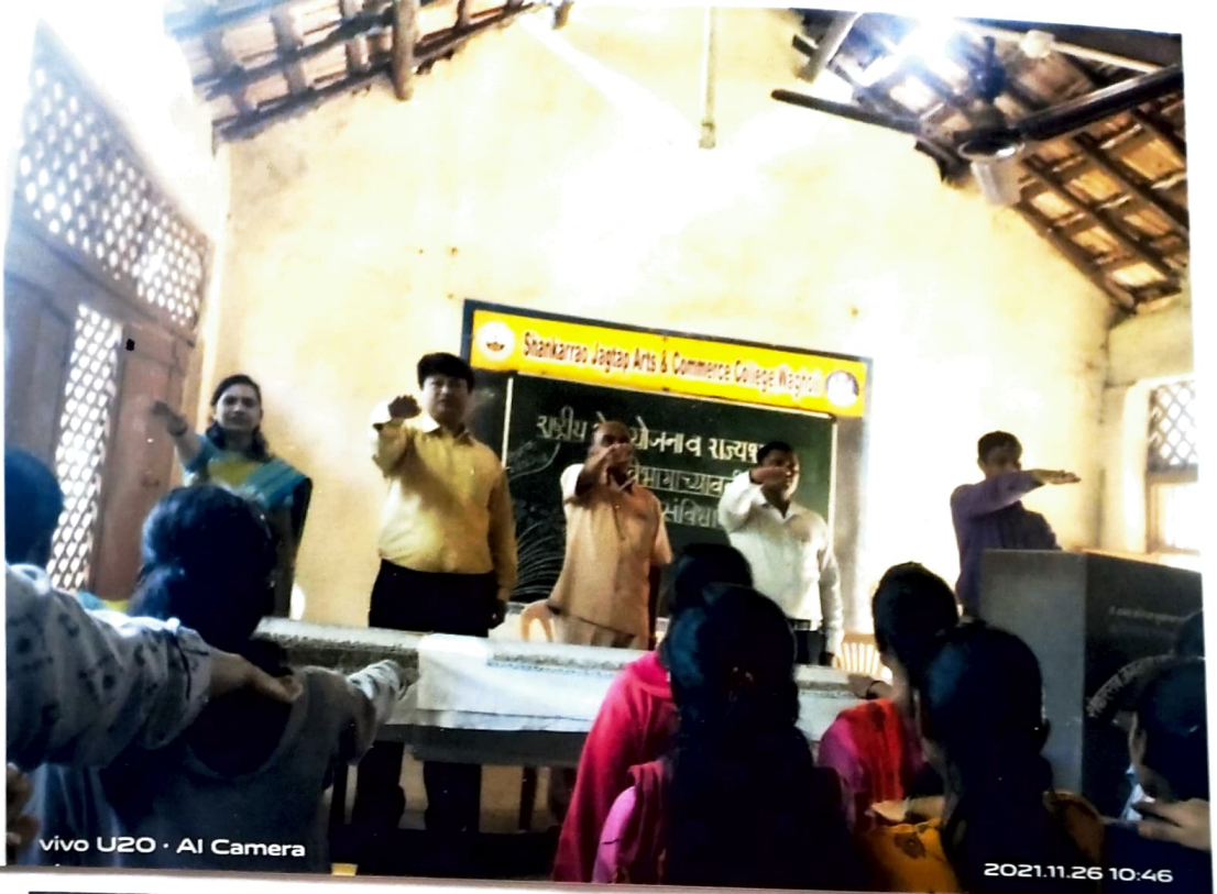
Staff and Students are taking pledge on 'Indian Constitution day', 26.11.2021