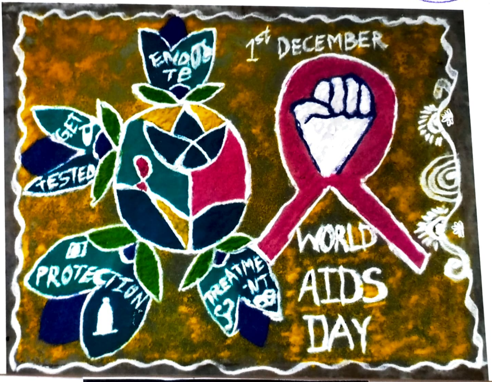
Rangoli Presentation about AIDS awareness