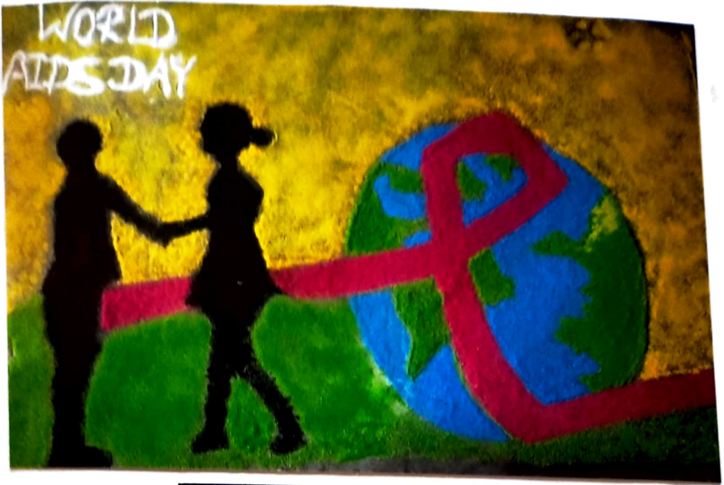
Rangoli Presentation about AIDS awareness