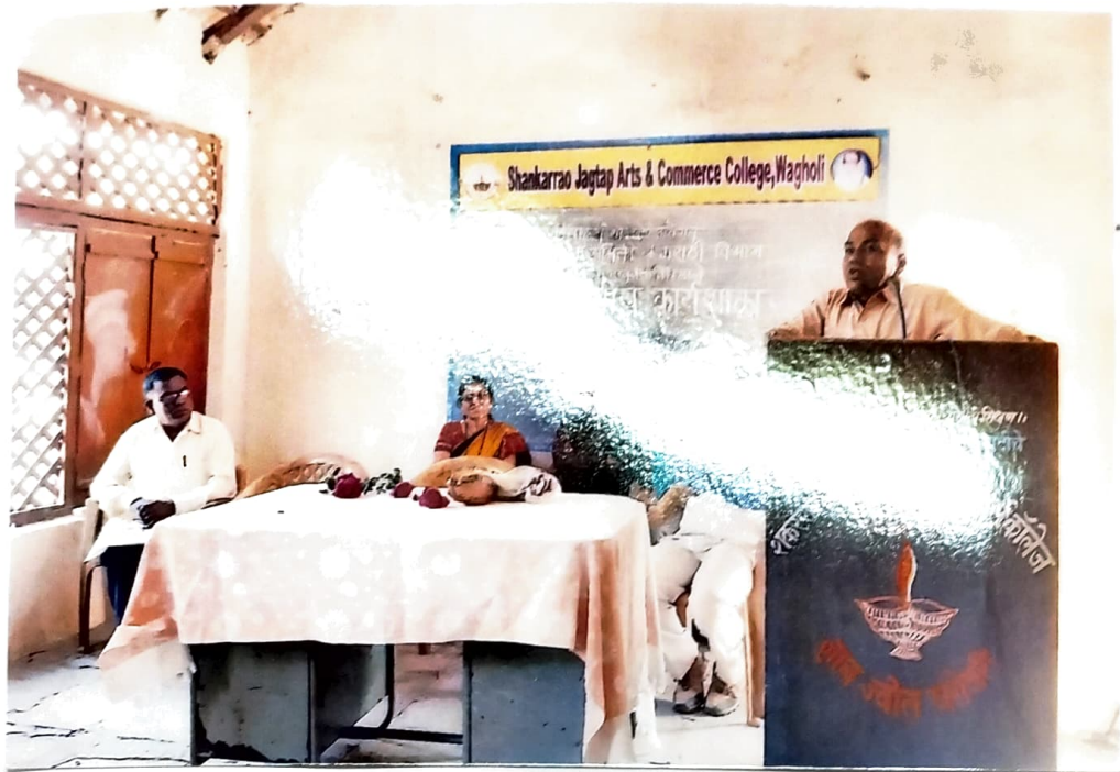
विद्यार्थी प्रकल्प उद्घाटन कार्यवाही - 7-1-2018