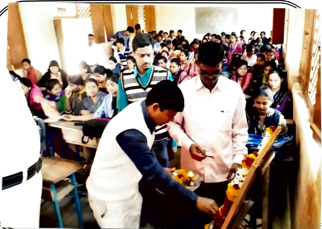
उद्घाटन - 7-1-2018