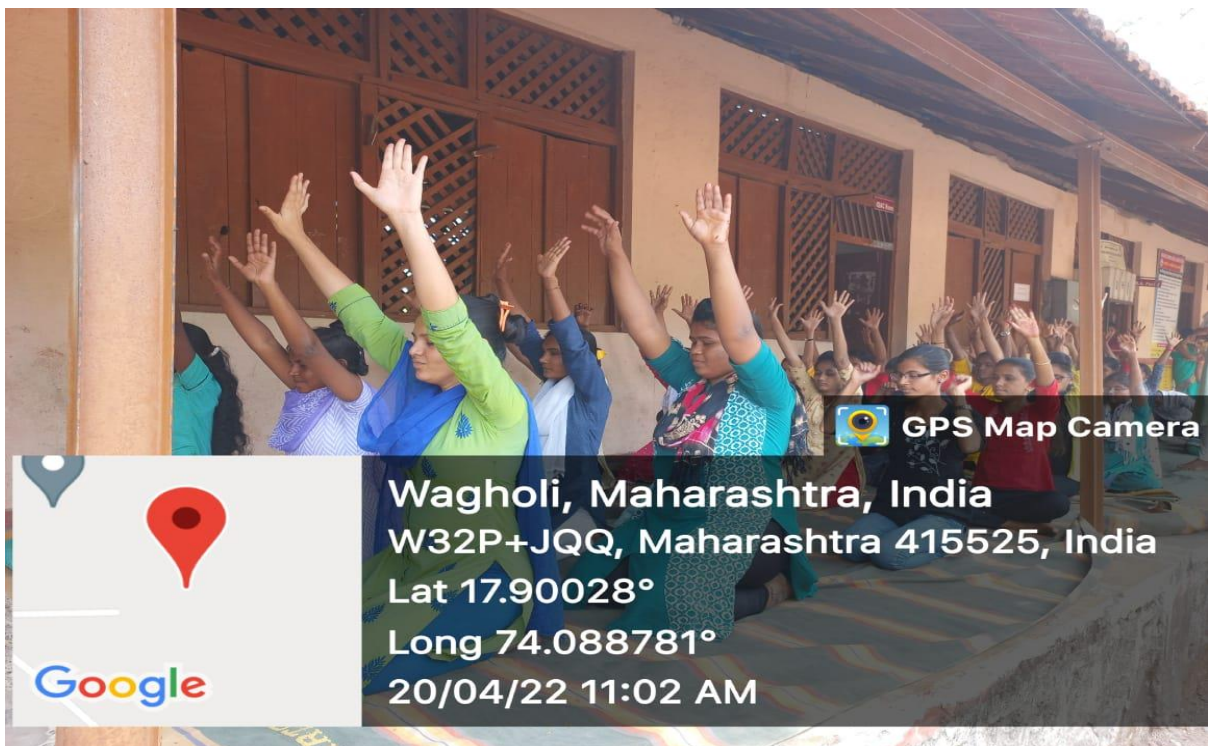
Students practicing yoga