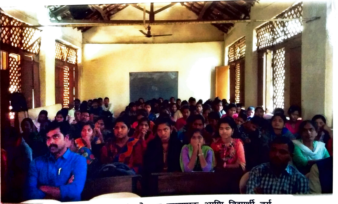
व्याख्यानाचा आनंद घेताना प्राध्यापक आणि विद्यार्थी वर्ग