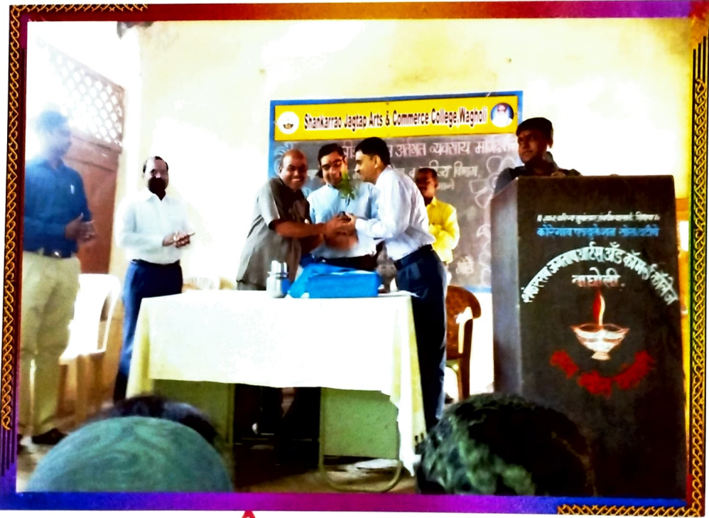
प्रमुख पाहुण्यांचे स्वागत करताना महाविद्यालयाचे प्राचार्य व इतर.