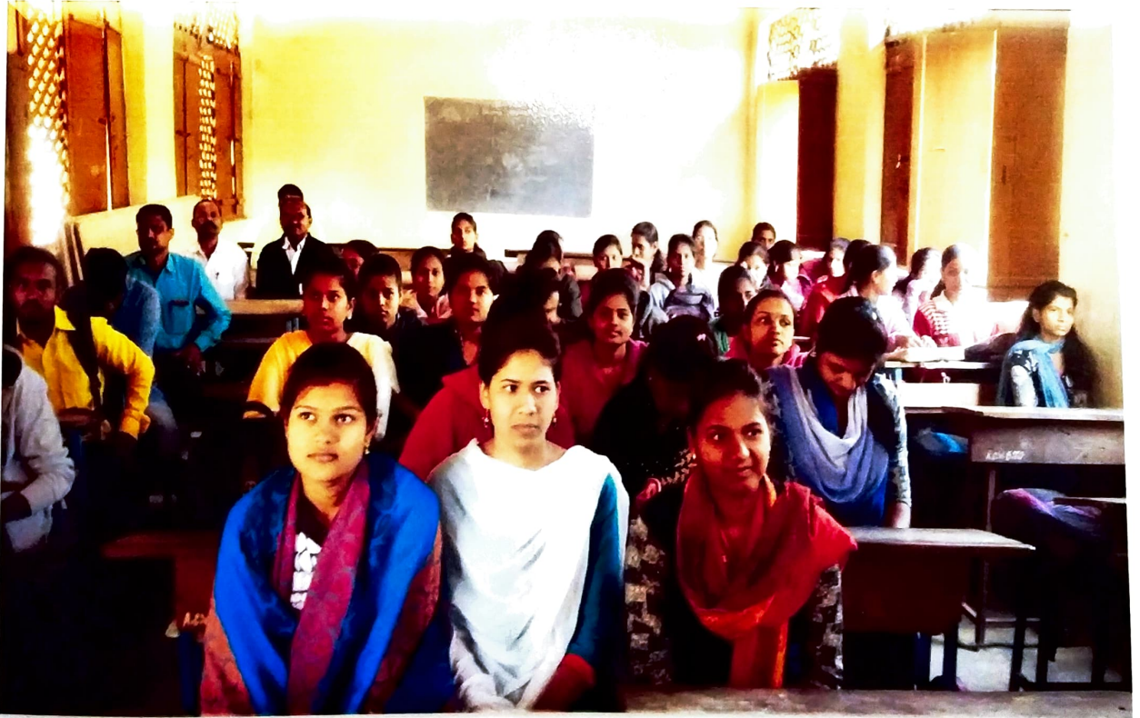
कार्यक्रमाचा आनंद घेताना विद्यार्थी